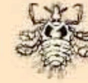
2 First instar nymph

After a week, the first instar nymph hatches and takes its first blood meal from a host.