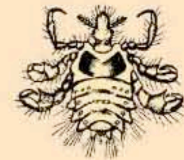
4 Third instar nymph

The adult lives from three to four weeks. The entire life cycle takes place on the host. If removed the louse will die within 48 hours.