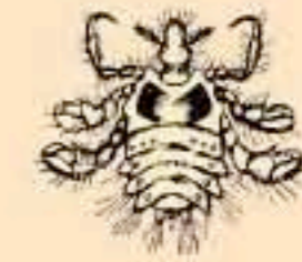
3 Second instar nymph